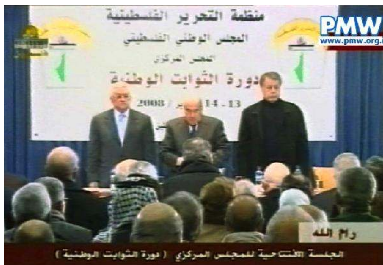
The picture is from the PLO Central Committee meeting

Along the same lines Abbas participated in the PLO Central Committee's meeting [in January 2008] with the PLO symbol, which places the Palestinian flag over the map of Israel, in the background. This symbolizes that all of Israel is, or will someday be, "Palestine."