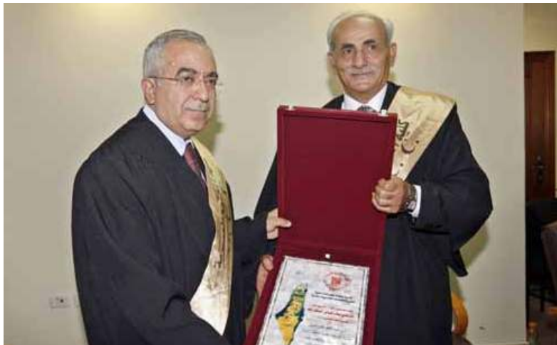
[Al-Hayat Al-Jadida (Fatah), June 8, 2008]

Below, PA Prime Minister Salaam Fayad accepts an award - the certificate is adorned with a map of Palestine covering all of Israel.